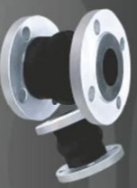
Rubber Expansion Joint

An Expansion Joint is the ideal solution of piping system protection from movement, vibration and pressure pulsation.