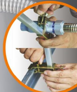
Daelin's Hit Item! This image is only for understanding of the products. It can be different from the actual products.