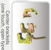
Center brackets (one touch, open type)