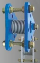
TPC (Tie Rods Type Pump Connector)